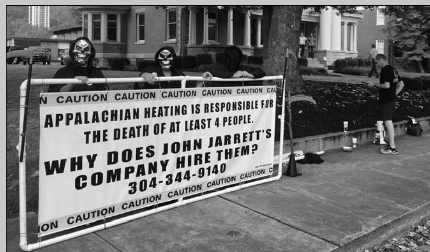
Members of Sheet Metal Workers Local 33 stand outside Jarrett Construction headquarters in Charleston to educate the public about Appalachian Heating, a subcontractor used by Jarrett.