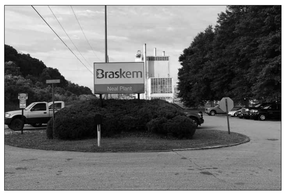
A recent outage at Braskem's Neal, WV facility was under budget, ahead of schedule and had no safety problems.

The report came at a June Tripartite Meeting between the owner, contractors and affiliates of the Tri-State Building and Construction Trades Council.