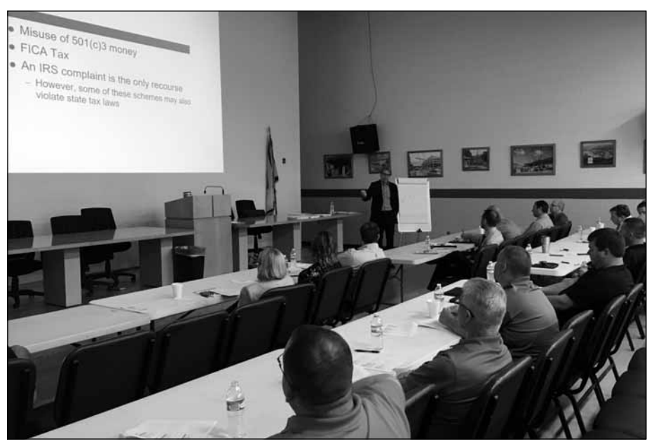
Operating Engineers Local 132 hosted a workshop on identifying payroll fraud put on by their International research department. The May 16 event, held at Local 132's Charleston office, was open to all crafts and focused on benefit fund fraud.

Sign up to get the ACT Report in your InBox! It's easy: Go to http://www.actwv.org/Newsletter/Signup. Fill out the form. Be sure to tell us your Craft & Local#. Then check your email for the authorization request. Click the link to verify that you- indeed- requested the email service and you're all set.