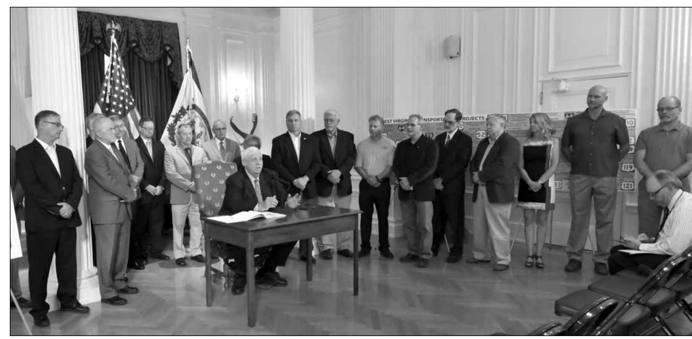
Representatives from the Trades and others join Governor Jim Justice at a bill signing ceremony to fund road construction. Justice also signed a proclamation setting the Road Bond vote date for October 7.

The Governor's plan is to use that Cont. on p. 3 >>