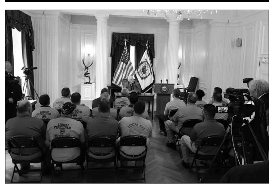
Members of the WV Laborers District Council attend a July 11 event at the capitol with Governor Jim Justice to recognize construction skills training that is connecting workers to new family-sustaining careers in the natural gas industry and other infrastructure projects.