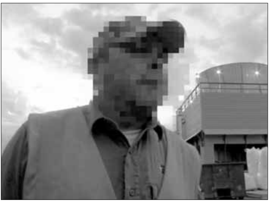
This worker at the Antero site in Doddridge County said he was one of around 20 electricians from Guatemala working at the waste water treatment site in May.

In 2009 an explosion in West Carrollton, Ohio at a Veolia plant leveled two buildings, damaged more than twenty homes up to a mile away and injured four workers, two seriously. ■