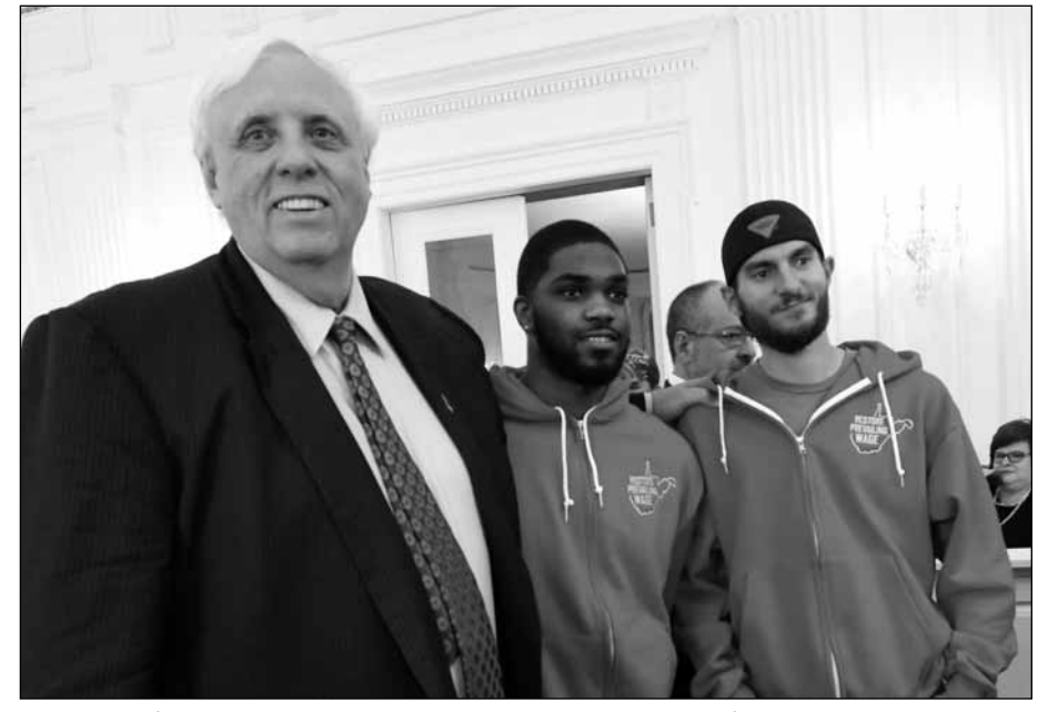
Members of the Keystone Mountain Lakes Regional Council of Carpenters were on hand when Governor Jim Justice held a press conference during the last week of the session urging legislators to focus on his jobs plan.

Current law would allow a worker to receive unemployment in a work stoppage if the company continues to operate and continue to receive prof-