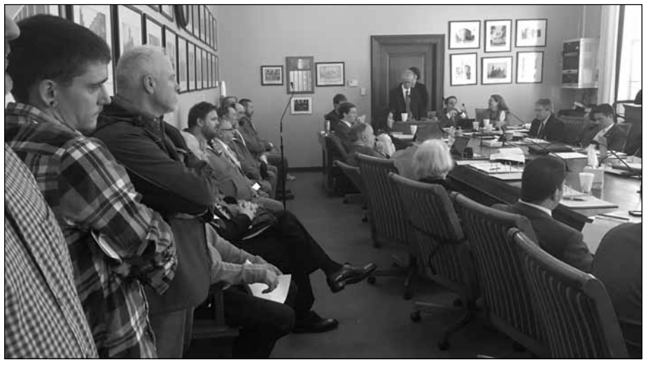
Members of Operating Engineers Local 132 and Iron Worker Local 769 watch as members of the House Judiciary Committee debate the Paycheck Deception bill.

stitutional for the private sector be-Cont. on p. 3>>