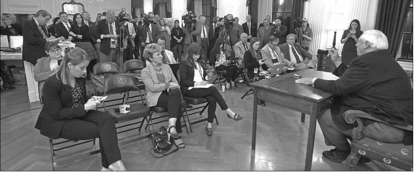
Governor Jim Justice held a press conference at 10:00pm on the final night of the legislative session saying he was very close to a budget deal with the Senate.