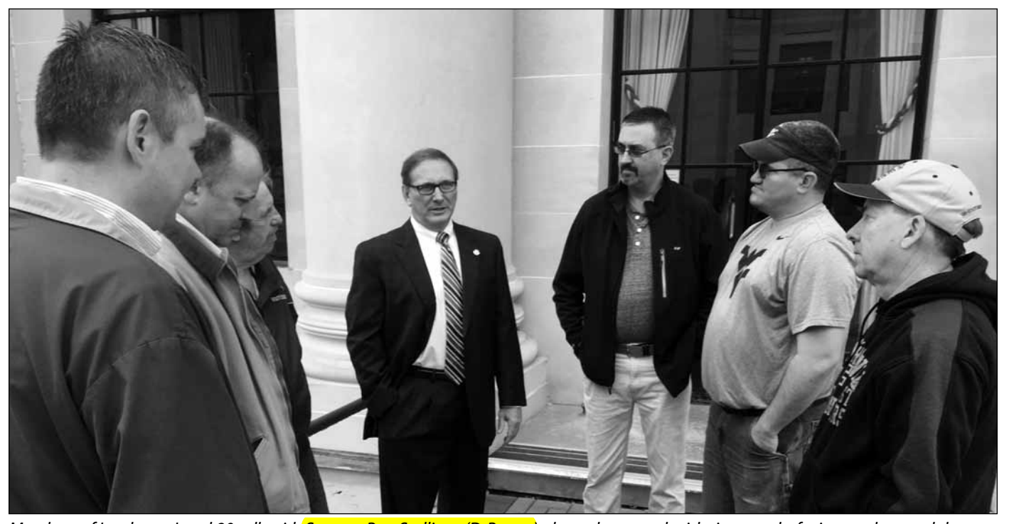
Members of Insulators Local 80 talk with Senator Ron Stollings (D-Boone) about the many legislative attacks facing workers and the construction industry.

Responsible contractor policies Cont. on p. 4>>