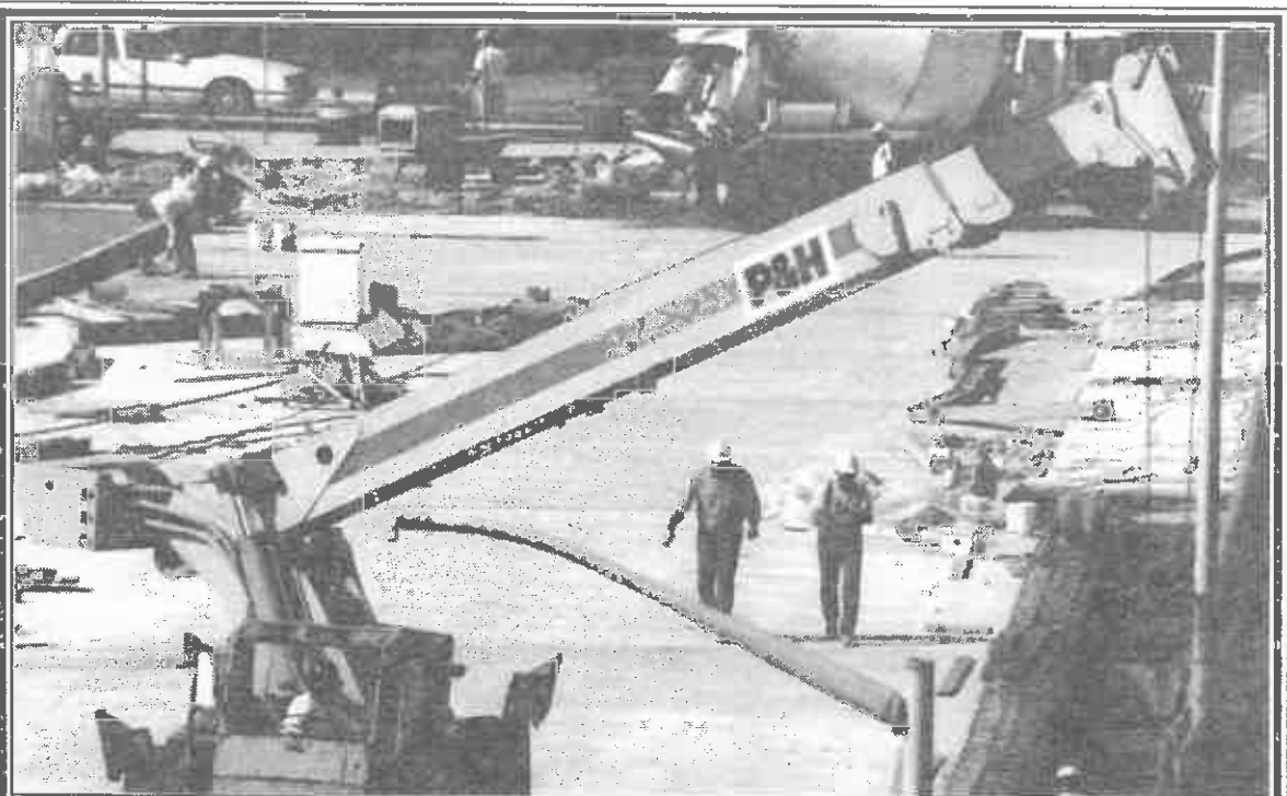
PUBLIC FUNDED CONSTRUCTION makes up a large portion of work available to construction workers. The Freedom Of Information ACT is an important tool in enabling the building and construction trades union to ensure a level playing field for fair contractors.

"In the process, West Virginia has become a leader in worker advancement."